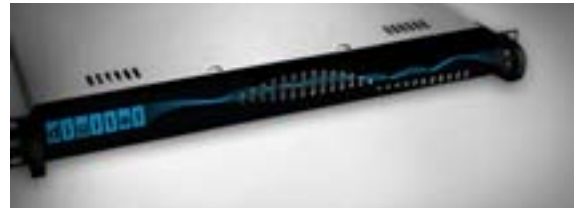
The digital Store Server can be mounted to a wall or placed in a server rack.

ECRS' retail-ready digital Store Server™ is a powerful in store, plug-and-play network appliance that securely hosts all vital retail store application services.